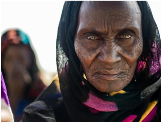
This is a Photograph taken of a lady who is the wife of the chief from a desert village of Pundu Duba.

Shown below are glimpses of what talent you will see at this event.